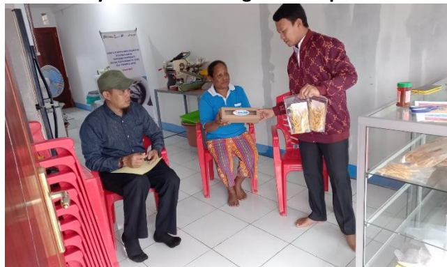
Figure 2. Home industry business of indigenous Papuan fishermen

their life choices. Furthermore, based on the characteristics of coastal communities (fishermen) and the scope of empowerment, the empowerment of fishermen should be carried out comprehensively.